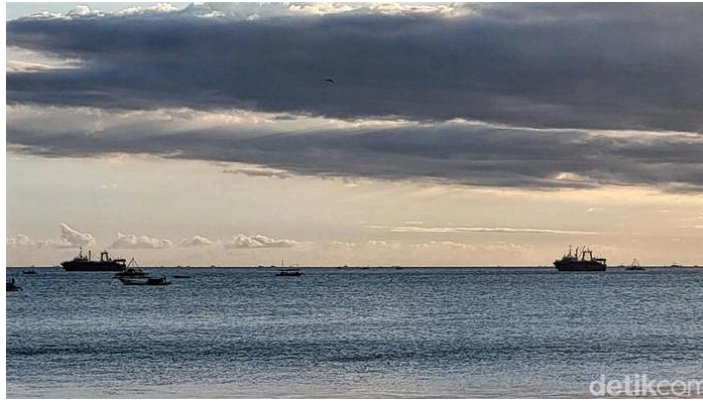
Figure 4. Photo of the vessels Run Zeng 03 and Run Zeng 05 when anchored at Pelabuhan Ratu

Until the last AIS transmission was detected on January 31 2024, the vessels Run Zeng 03 and Run Zeng 05 had been in the Indonesian EEZ (Exclusive Economic Zone) for some time. Currently the AIS devices of the two vessels are switched off. Considering that the two vessels are industrial-scale foreign fishing vessels, carrying crews who are all foreign nationals, do not have licenses to fish in the waters of the Republic of Indonesia, and are not tracked properly using AIS navigation tools, IOJI considers these vessels to be at high risk as illegal fishing perpetrator in Indonesia EEZ.