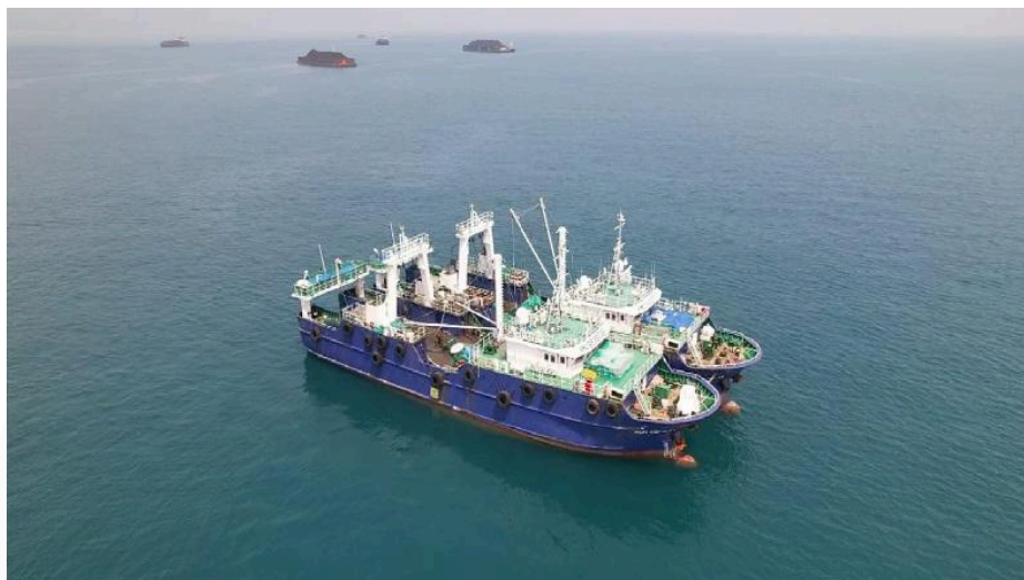
Figure 5. Fishing vessels Run Zeng 03 and Run Zeng 05 While in the waters of Pelabuhan Ratu

Until the last AIS transmission was detected on January 31 2024, the vessels Run Zeng 03 and Run Zeng 05 had been in the Indonesian EEZ (Exclusive Economic Zone) for some time. Currently the AIS devices of the two vessels are switched off. Considering that the two vessels are industrial-scale foreign fishing vessels, carrying crews who are all foreign nationals, do not have licenses to fish in the waters of the Republic of Indonesia, and are not tracked properly using AIS navigation tools, IOJI considers these vessels to be at high risk as illegal fishing perpetrator in Indonesia EEZ.