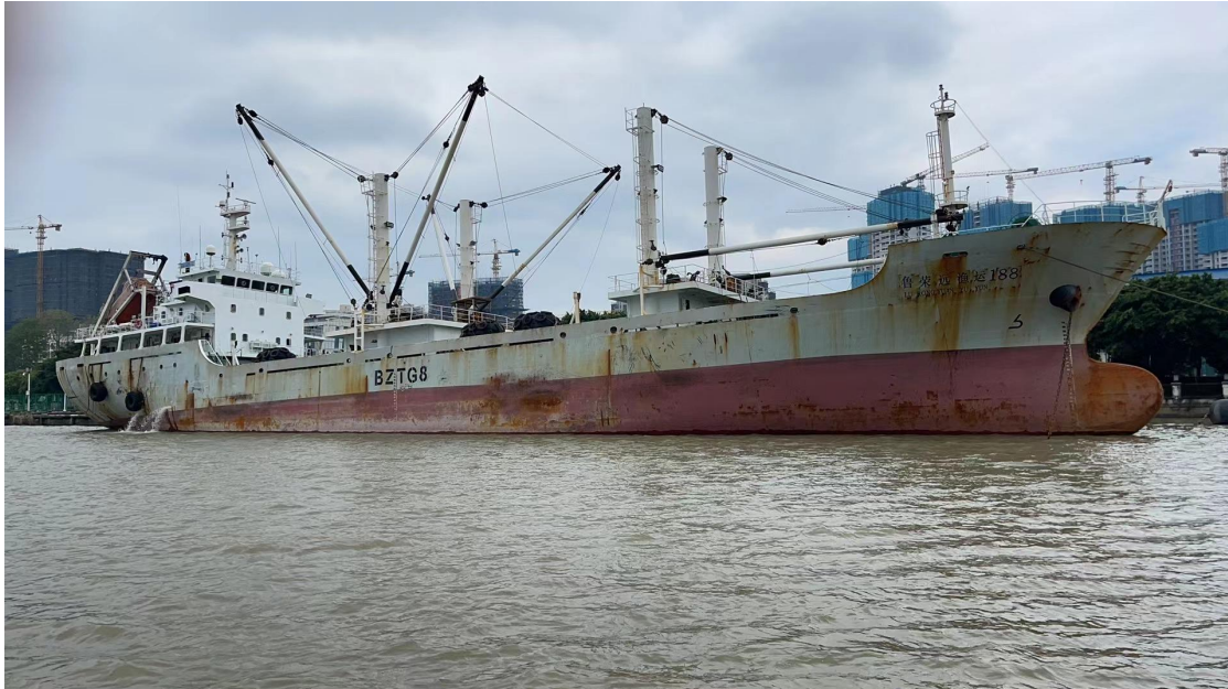
Figure 1. Lu Rong Yuan Yu Yun 188