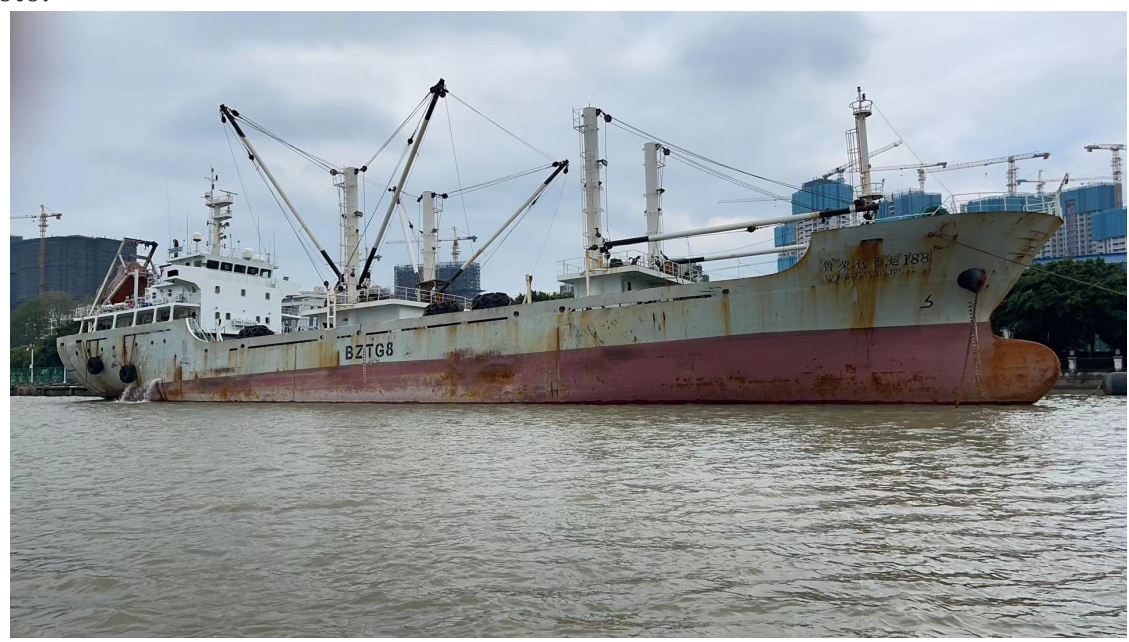
Figure 1. Lu Rong Yuan Yu Yun 188